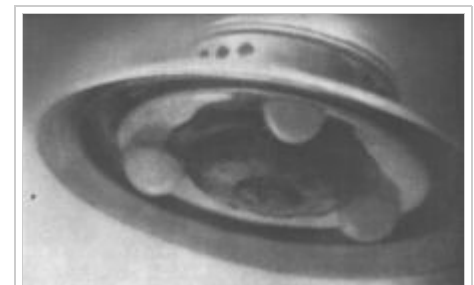
Adamski's photograph, which is said to be of a UFO, taken on December 13, 1952.