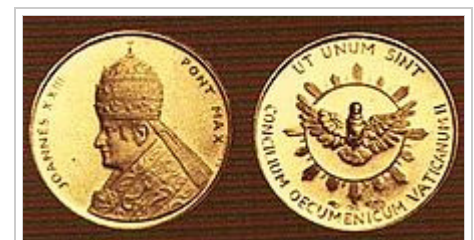
Adamski's "Golden Medal of Honor", which he claimed to have received during his meeting with Pope John XXIII.

In 1962, Mr Adamski announced that he would be attending an interplanetary conference held on the planet Saturn. [4] In 1963, Mr Adamski claimed that he had had a secret meeting with Pope John XXIII and that he had received a "Golden Medal of Honor" from the Pope. [17][18] Adamski, at the request of the extraterrestrials he was allegedly in contact with, met with the Pope in order to request a "final agreement" from him because of his decision not to communicate directly with any extraterrestrials, and also to offer him a liquid substance in order to save him from the gastric enteritis that he suffered from, which would later become acute peritonitis. [19]