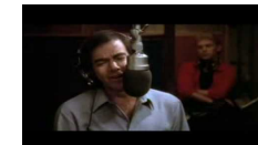
Love On The Rocks - Neil Diamond..