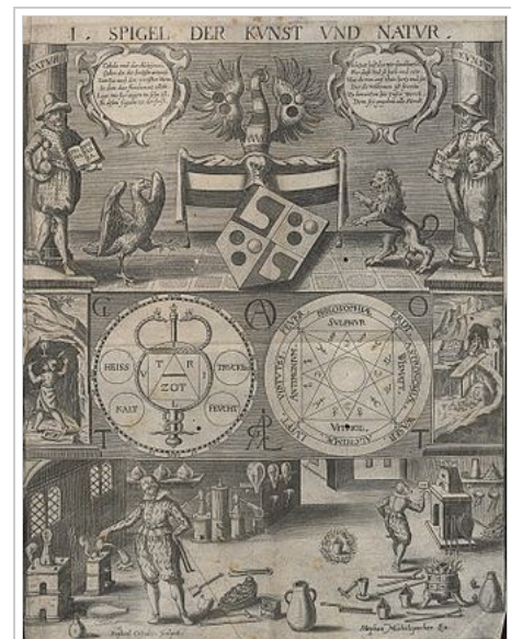
Plate 1 from Michelspacher Cabala: Spiegel der Kunst und Natur , 1615.

Categories: Alchemy | Acronyms | Names of God in Judaism