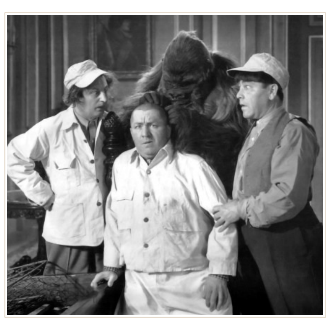
Gurus brainstorming at Prabhupada conference

Posted on September 10, 2009 by Vrajabhumi