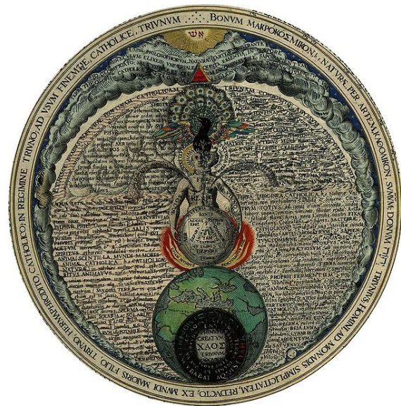
Androgyne of Heinrich Khunrath, Amphitheatrum Sapientiae Aeternae.

Later in the 19th century, the name of Baphomet became further associated with the occult. Eliphas Lévi published Dogme et Rituel de la Haute Magie ("Dogmas and Rituals of High Magic") as two volumes ( Dogme 1854, Rituel 1856), in which he included an image he had drawn himself which he described as Baphomet and "The Sabbatic Goat", showing a winged humanoid goat with a pair of breasts and a torch on its head between its horns ( illustration, top ). This image has become the best-known representation of Baphomet. Lévi considered the Baphomet to be a depiction of the absolute in symbolic form and explicated in detail his symbolism in the drawing that served as the frontispiece: [47]