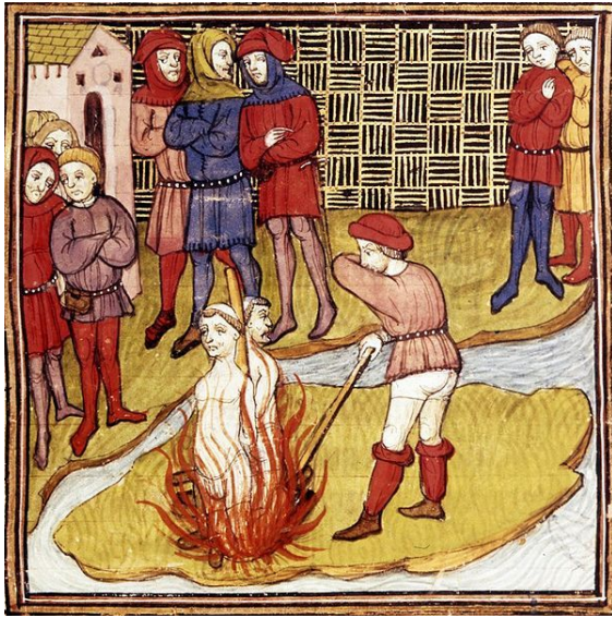
Two Templars burned at the stake, from a French 15th-century manuscript