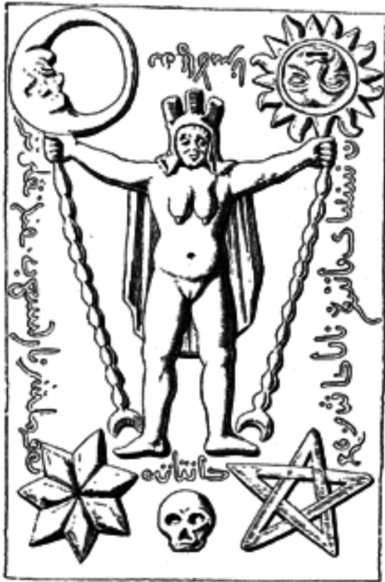
Joseph von Hammer-Purgstall (1774-1856) associated a series of carved or engraved figures found on a number of supposed 13th century Templar artifacts (such as cups, bowls and coffers) with the Baphometic idol.

panied by serpents, the sun and moon, and other strange emblems, and bearing many inscriptions, mostly in Arabic ... The inscriptions he reduces almost all to Metel , which] ... is, according to him, not the Μητις of the Greeks, but the Sophia , Achamot Prunikos of the Ophites, which was represented half man, half woman, as the symbol of wisdom, unnatural voluptuousness and the principle of sensuality ... He asserts that those small figures are such as the Templars, according to the statement of a witness, carried with them in their coffers. Baphomet signifies Βαφη Μητεος , baptism of Metis , baptism of fire , [41] or the Gnostic baptism , an enlightening of the mind , which, however, was interpreted by the Ophites, in an obscene sense, as fleshy union ... the fundamental assertion, that those idols and cups came from the Templars, has been considered as unfounded, especially as the images known to have existed among the Templars seem rather to be images of saints. [42]