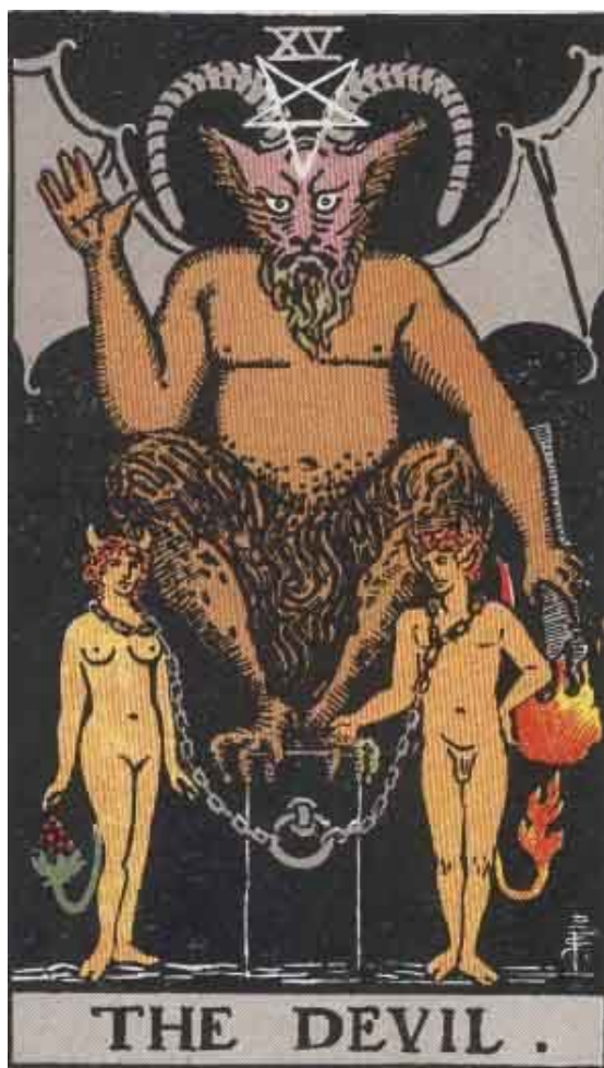
The Devil in the Rider-Waite tarot deck.

Baphomet, as Lévi's illustration suggests, has occasionally been portrayed as a synonym of Satan or a demon,