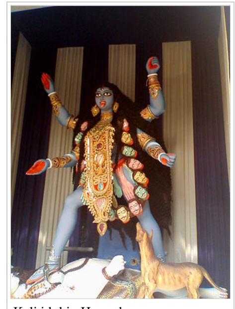
Kali idol in Howrah

The Kalika Purana describes Kali as possessing a soothing dark complexion, as perfectly beautiful, riding a lion, four-armed, holding a sword and blue lotuses, her hair unrestrained, body firm and youthful.<sup>[37]</sup>