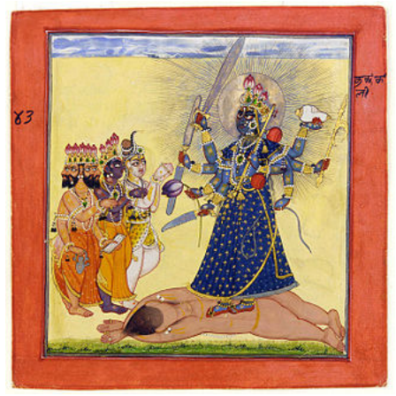
Bhadrakali worshipped by the Trimurti – the male Trinity in the North Indian Basohli style.