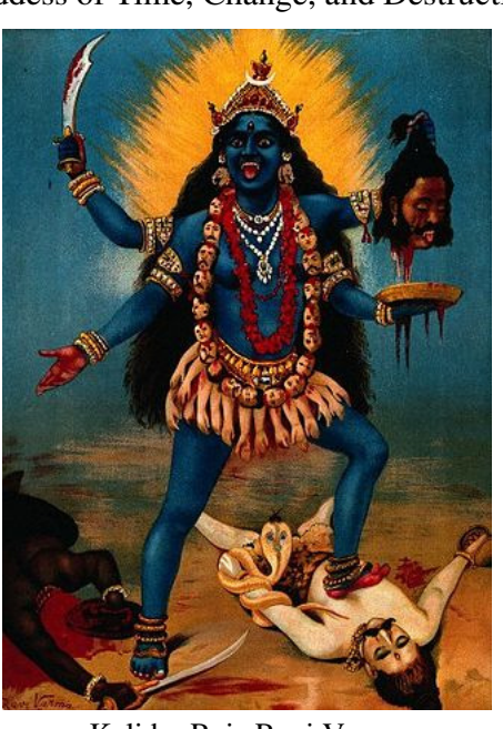
Kali by Raja Ravi Varma