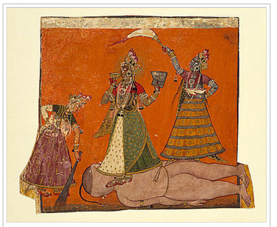
Bhadrakali, circa 1675 painting; made in: India, Himachal Pradesh, Basohli, now placed in LACMA Museum (M.72.53.7)

Bhadrakali is around 6 feet tall and is portrayed in the form of slaying Daruka. Tiruvarkattu Bahagavaty Temple is famous for the removal of black magic.