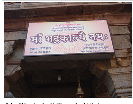
Ma Bhadrakali Temple Ujjain