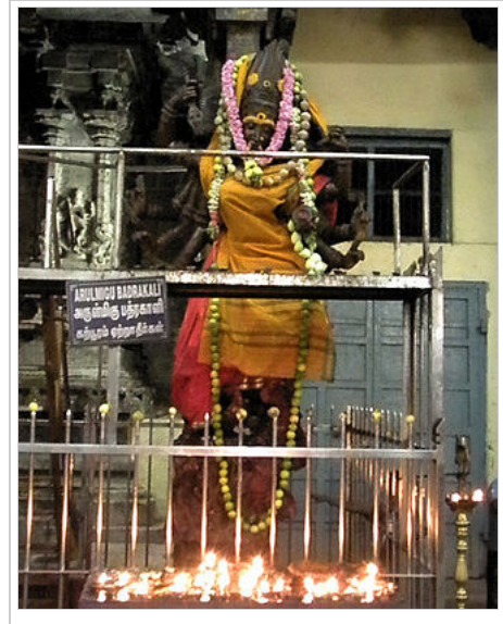
Murti of Bhadrakali in Madurai Meenakshi Temple