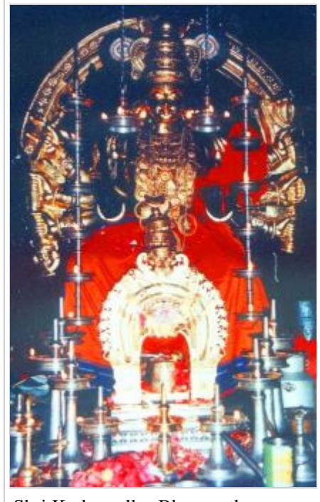
Shri Kodungallur Bhagavathy