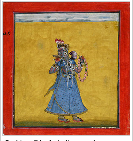
Goddess Bhadrakali, gouache on paper (ca. 1660–70)

Some communities, like the Kodavas and Nairs, worship this deity as family deity. They worship certain weapons at their temples which they believe to be the weapons used by the goddess.the Kuladevata or community deity of Kudumbicommunity is Kodungallur amma,the mother goddess of kodungallur.Kodungallur Bhagavathy Templeis one of the most famous temples in kerala, dediated to bhadrakali.during the 'thalappoli' festival,which is celebrated mainly on Makar Sankranti,kudumbi people from all over the state(especially south kerala) comes to the temple. Bhadrakali is also the tutelary deity of the Nadar community of Tamil Nadu. [10]