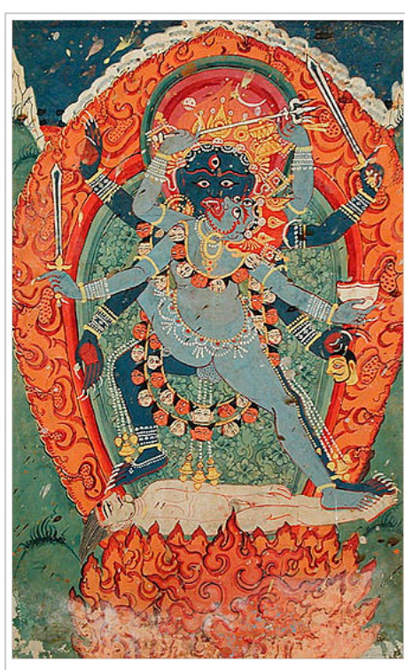
Kali and Bhairava (the terrible form of Shiva) in Union, 18th century, Nepal

Although there is often controversy surrounding the images of divine copulation, the general consensus is benign and free from any carnal impurities in its substance. In Tantra the human body is a symbol for the microcosm of the universe; therefore sexual process is responsible for the creation of the world. Although theoretically Shiva and Kali (or Shakti) are inseparable, like fire and its power to burn, in the case of creation they are often seen as having separate roles. With Shiva as male and Kali as female it is only by their union that creation may transpire. This reminds us of the prakrti and purusa doctrine of Samkhya wherein prakāśa- vimarśa has no practical value, just as without prakrti, purusa is quite inactive. This (once again) stresses the interdependencies of Shiva and Shakti and the vitality of their union. [48]