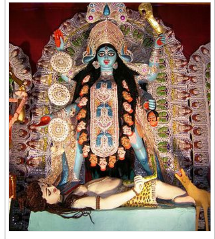
Kali Puja festival in Kolkata.

Kali is also a central figure in late medieval Bengali devotional literature, with such devotees as Ramprasad Sen (1718–75). With the exception of being associated with Parvati as Shiva's consort, Kāli is rarely pictured in Hindu legends and iconography as a motherly figure until Bengali devotions beginning in the early eighteenth century. Even in Bengāli tradition her appearance and habits change little, if at all.<sup>[16]</sup>