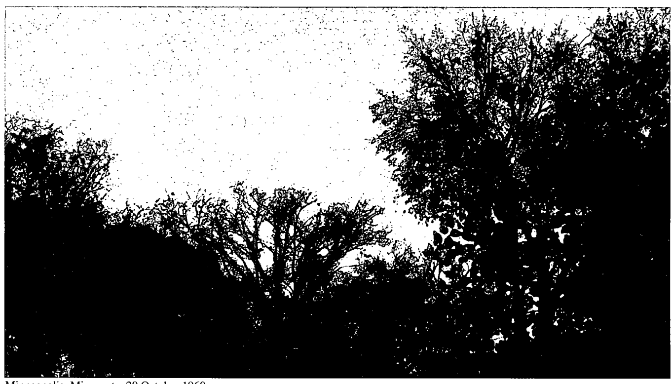
Minneapolis, Minnesota, 20 October 1960