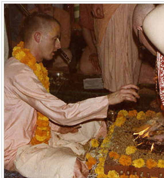
Satsvarupa das Goswami During ISKCON diksha ceremony in 1979.