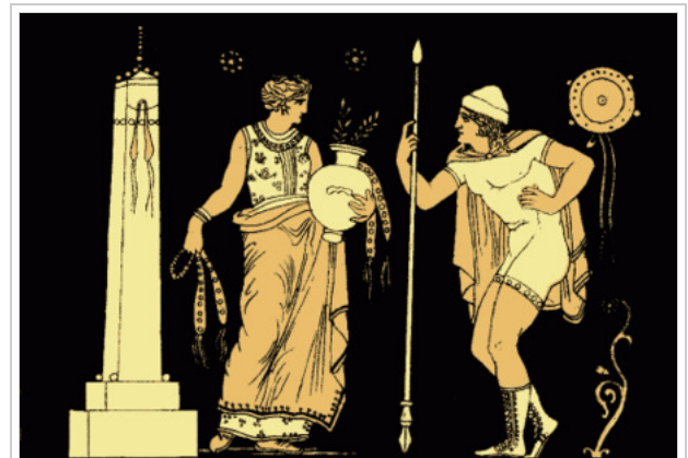
Electra and Orestes, from an 1897 Stories from the Greek Tragedians , by Alfred Church