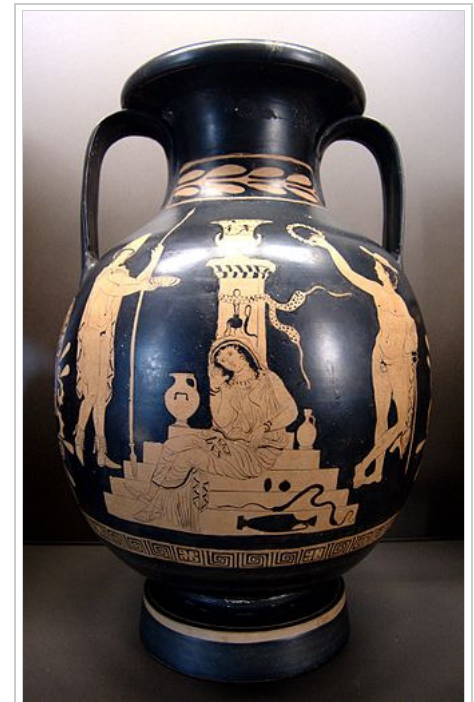
Orestes, Electra and Hermes at the tomb of Agamemnon, lucanian red-figure pelike, c. 380–370 BC, Louvre (K 544)