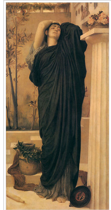
Electra at the Tomb of Agamemnon , Frederic Leighton c. 1869