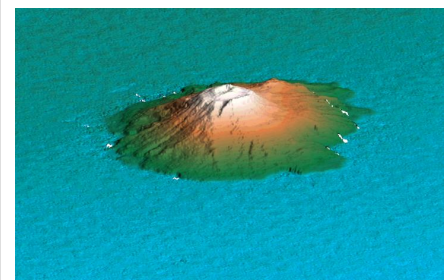
Miyake Island, about 100 km south of Tokyo