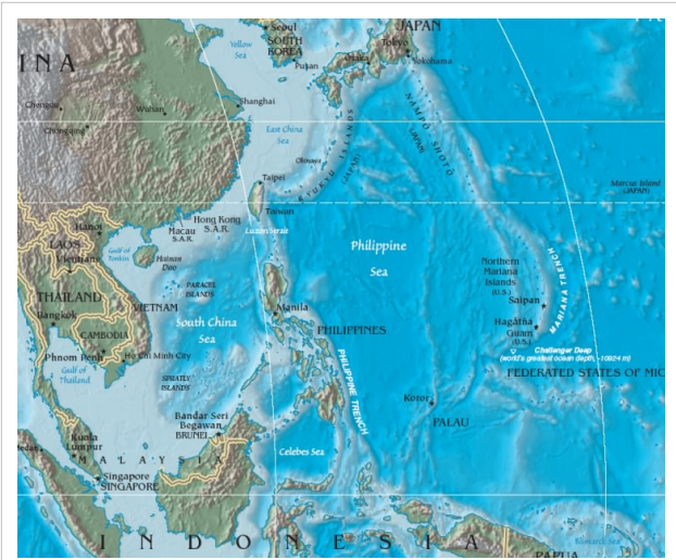
The Formosa Triangle contains most of the northeast Philippine Sea.

The Japanese research vessel that Berlitz named, Kaiyo Maru No 5 , had a crew of 31 aboard. While investigating activity of an undersea volcano, Myōjin-shō, about 300 km south of the Devil's Sea, it was destroyed by an eruption on 24 September 1952. Some wreckage was recovered. [2] At least one ship sent an SOS. The other seven boats were small fishing boats lost between April 1949 and October 1953 somewhere between Miyake Island and Iwo Jima, a distance of 1,200 kilometres (750 mi).(Kusche: 258)