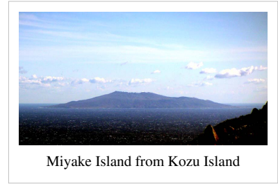
Miyake Island from Kozu Island