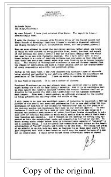
Copy of the original.

President Eisenhower, as you may already know, was spirited over to Muroc one night during his visit to Palm Springs recently. And it is my conviction that he will ignore the terrific conflict between the various 'authorities' and go directly to the people via radio and television -- if the impasse continues much longer. From what I could gather, an official statement to the country is being prepared for delivery about the middle of May.