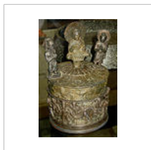
Hamsa border on the Kanishka casket, 2nd century CE