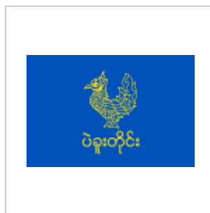
Flag of Bago Division, Myanmar, which depicts the hamsa