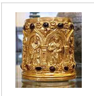
Hamsa birds between the architectural spires on the Bimaran casket, 1st century CE