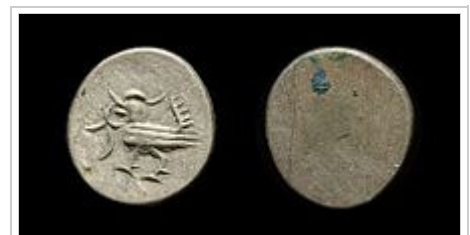
Cambodia 1600-1800 AD, Silver Hamsa bird Coin (Fuang)

The name in other languages in which it is culturally important are Hindi: hans , Burmese: ဟံသာ, IPA: [hínθà], and commonly spelt hintha or hinthar ; Mon: ဟံသာ, [həŋsa] or hongsa ; Shan: ၵင်းသို, [haŋ¹ sʰaː˥] or hong ; Thai: หงส์, [hǒŋ]. The hintha (hamsa) is widely depicted in Burmese art, and has been adopted as the symbol of the Mon people. It is also depicted on the subdivision flags of Bago Division and Mon State, both of which have been historic Mon strongholds.