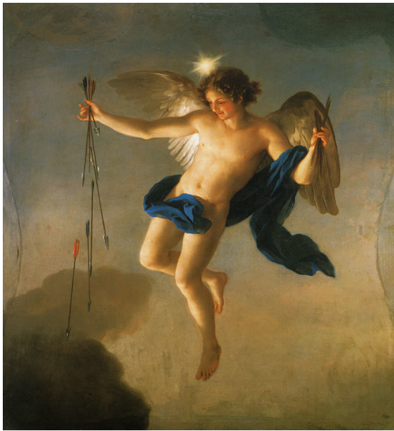
Hesperus as Personification of the Evening Star by Anton Raphael Mengs (1765).

In Greek mythology, Hesperus (Ancient Greek: Ἑσπε-