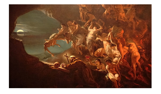
"The Temptation of Saint Hilarion", by Octave Tassaert, c.1857 (Montreal Museum of Fine Arts)

Hilarion went to the area southwest of Majoma, the port of Gaza, that was limited by the sea at one side and marshland on the other. Because the district was notorious for