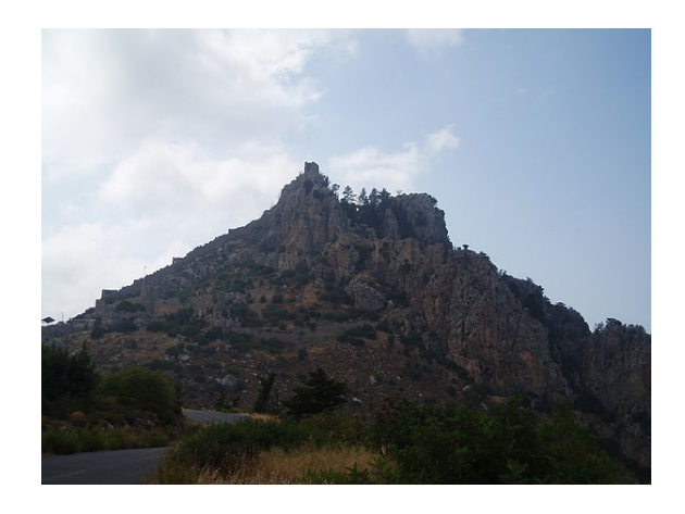
Saint Hilarion Castle, Kyrenia, Cyprus

Miracles were attributed to him.<sup>[4]</sup> His first miracle was when he cured a woman from Eleutheropolis (a Roman city in Syria Palaestina) who had been barren for 15 years.<sup>[5]</sup> Later, cured three children of a fatal illness, healed a paralysed charioteer, and expelled demons.<sup>[5]</sup>