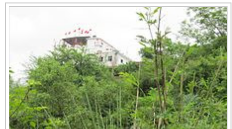
Jayanti Devi Temple

This tank was earlier in use. It is a concrete construction and steps lead down to it from two sides. The other two sides are bound by the rocky wall of the hillock. There are a few shops along the steps selling nicknacks —