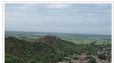
View from top of Jayanti Devi temple