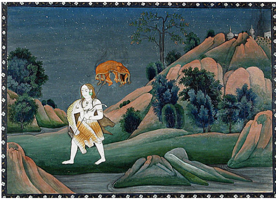
Shiva carrying the corpse of Sati (goddess)

The mythology of Daksha yaga and Sati's self-