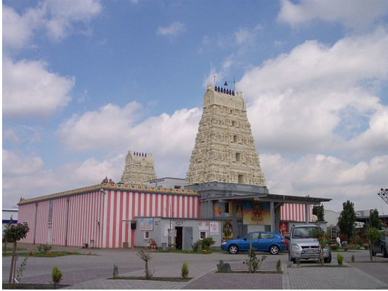
The Sri-Kamadchi-Ampal-Temple in Hamm

2002, claims to be the second largest Hindu temple in Europe. [1]