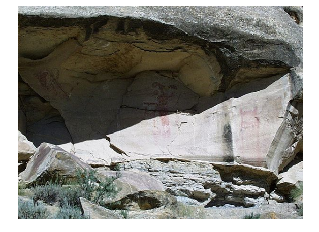
Kokopelli pictograph "Cañon Pintado", ca. 850–1100 AD, Rio Blanco County, Colorado