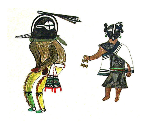
Kokopelli and Kokopelli Mana as depicted by the Hopi

For other uses, see Kokopelli (disambiguation). Kokopelli is a fertility deity, usually depicted as a