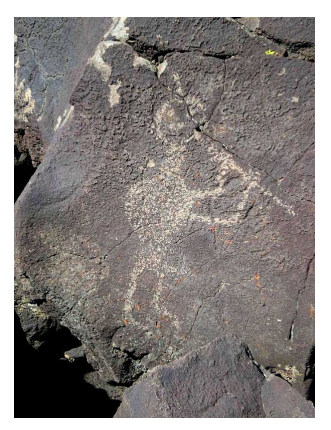
Kokopelli petroglyph located on BLM land near Embudo, New Mexico

Among the Hopi, Kokopelli carries unborn children on his back and distributes them to women; for this reason, young girls often fear him. He often takes part in rituals relating to marriage, and Kokopelli himself is sometimes depicted with a consort, a woman called Kokopelmama by the Hopi.<sup>[1]</sup> It is said that Kokopelli can be seen on the full and waning moon, much like the "rabbit on the moon".