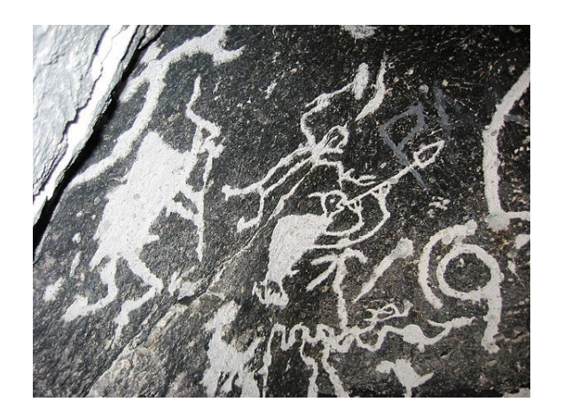
Petroglyph of Kokopelli in the "Rio Grande Style" of the ancestral Pueblo culture after the year 1300 AD; taken at Mortendad Cave near Los Alamos, NM

first known images of him appear on Hohokam pottery dated to sometime between 750 and 850 AD.