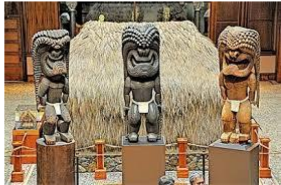
Three Kū statues reunited at the Bishop Museum in 2010.

Kū-ka-ili-moku was the guardian of Kamehameha I who erected monuments to the deity at the Holualoa Bay royal center and his residence at Kamakahonu. Three enormous statues of the god Kū were reunited for the first time in almost 200 years at the Bishop Museum in Honolulu in 2010. [4] They were dedicated by Kamehameha at one of his temples on the archipelago in the late eighteenth or early nineteenth centuries. These very rare statues (no others are known extant) were later acquired by the Bishop Museum, the Peabody Essex Museum in Salem, Massachusetts and the British Museum in London. [5][6] One feathered god image in the Bishop Museum, Honolulu is thought to be Kamehameha I's own image of his god. However it is still unclear whether all feathered god images represent Kū. [7]