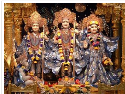
Lakshaman (far left) with Rama (centre), Sita (far right) and Hanuman, Hare Krishna temple, Watford, England