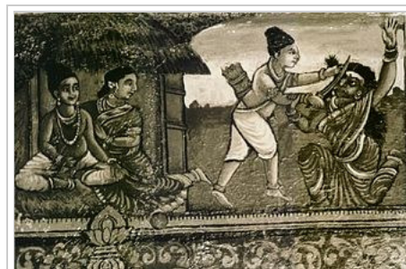
Humiliation of Shurpanakha