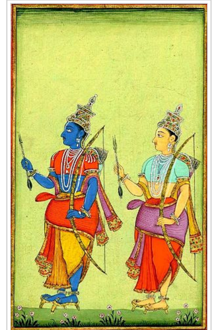
Sri Rama and Lakshmana

Retrieved from "http://en.wiktionary.org/w/index.php?title=Lakshmana&oldid=21207207"