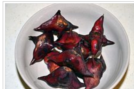
water caltrop seeds in diamond shape (마름모, 菱形)

菱 ( Pinyin líng ( ling2 ), Wade-Giles ling 2 )