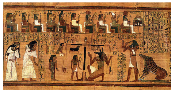
BD Weighing of the Heart Book of the Dead written on papyrus showing the "Weighing of the Heart" in the Duat using the feather of Maat as the measure in balance

Egyptians were often entombed with funerary texts in order to be well equipped for the afterlife as mandated by Egyptian burial customs. These often served to guide the deceased through the afterlife, and the most famous one is the Book of the Dead or Papyrus of Ani (known to the ancient Egyptians as The Book of Coming Forth by Day ). The lines of these texts are often collectively called the "Forty-Two Declarations of Purity". [27] These declarations varied somewhat from tomb to tomb as they were tailored to the individual, and so cannot be considered a canonical definition of Maat. Rather, they appear to express each tomb owner's individual practices in life to please Maat, as well as words of absolution from misdeeds or mistakes, made by the tomb owner in life could be declared as not having been done, and through the power of the written word, wipe particular misdeed from the afterlife record of the deceased. Many of the lines are similar, however, and paint a very unified picture of Maat. [27]