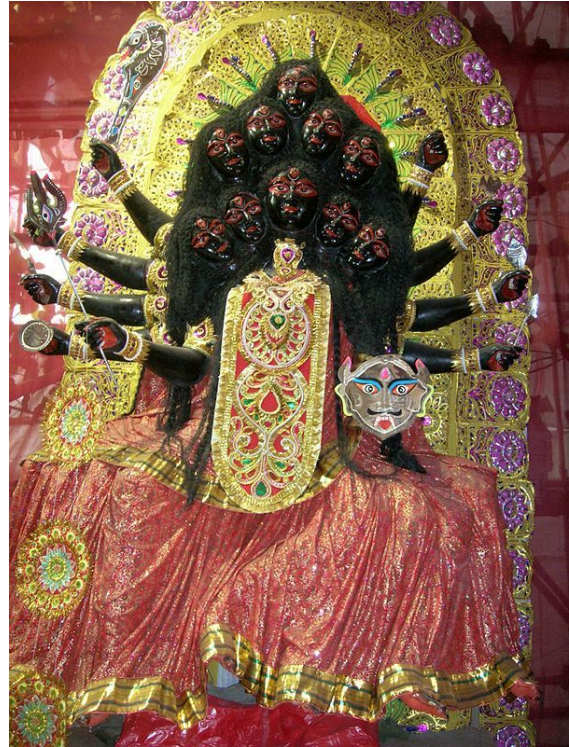
The ten-headed Mahakali.

Her most common four armed iconographic image shows each hand carrying variously a sword, a trishul (trident),