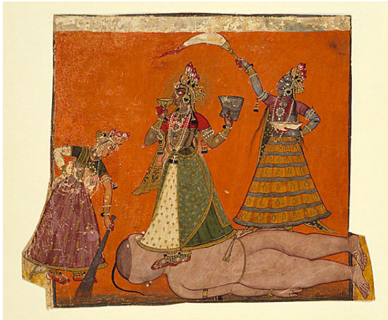
Bhadrakali (a gentle form of Kali), circa 1675. A painting made in India, Himachal Pradesh, Basohli, now placed in LACMA.

In her most famous pose as Daksinakali , popular legends say that Kali, becoming drunk on the blood of her victims on the battlefield, dances with destructive frenzy. She is about to destroy the whole universe when, urged by all the gods, Shiva lies in her way to stop her. In her fury, she fails to see the body of Shiva lying amongst the corpses on the battlefield and steps upon his chest. [25] Realizing Shiva lies beneath her feet, her anger is pacified and she calms her fury. Though not included in any of the puranas, popular legends state that Kali was ashamed at the prospect of keeping her husband beneath her feet and thus stuck her tongue out in shame. The Devi-Bhagavata Purana , which goes into great depths about the goddess Kali, reveals the tongue's actual symbolism.