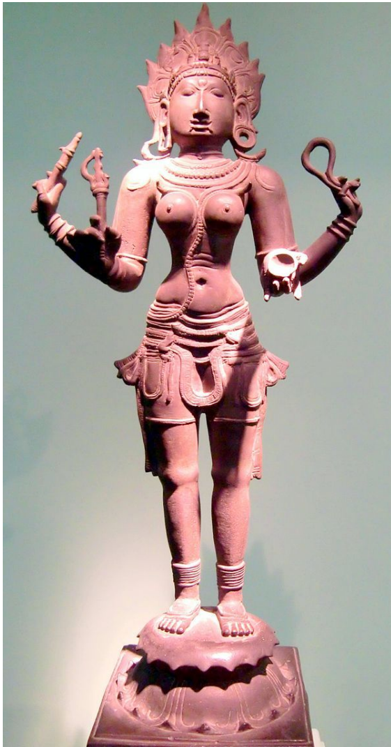
A Tamil depiction of Kali

Classic depictions of Kali share several features, as follows: