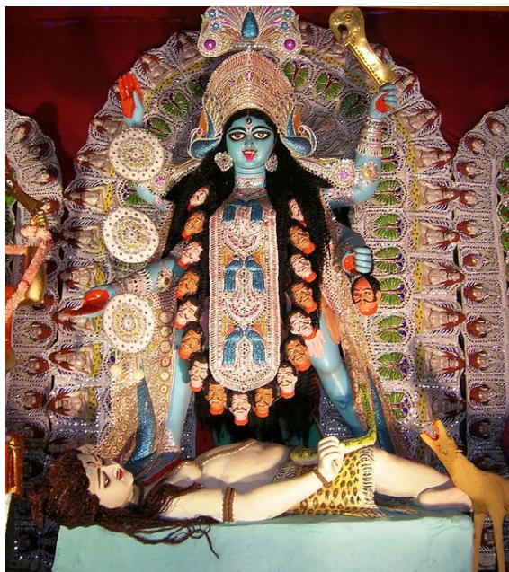
Kali Puja festival in Kolkata.

Hindu legends and iconography as a motherly figure until Bengali devotions beginning in the early eighteenth century. Even in Bengali tradition her appearance and habits change little, if at all. [16]