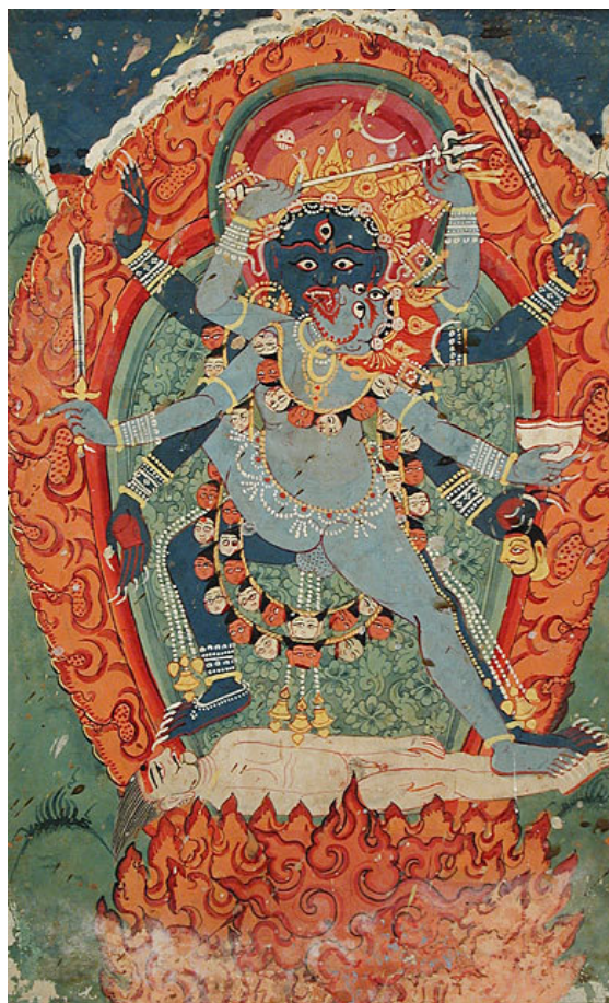
Kali and Bhairava (the terrible form of Shiva) in Union, 18th century, Nepal

To properly understand this complex Tantric symbolism it is important to remember that the meaning behind Shiva and Kali does not stray from the non-dualistic parlance of Shankara or the Upanisads. According to both the Mahanirvana and Kularnava Tantras, there are two distinct ways of perceiving the same absolute reality. The first is a transcendental plane which is often described as static, yet infinite. It is here that there is no matter, there is no universe and only consciousness exists. This form of reality is known as Shiva, the absolute Sat-Chit-Ananda—existence, knowledge and bliss. The second is an active plane, an immanent plane, the plane of matter, of Maya, i.e., where the illusion of space-time and the appearance of an actual universe does exist. This form of reality is known as Kali or Shakti, and (in its entirety) is still specified as the same Absolute Sat-Chit-Ananda. It is here in this second plane that the universe (as we commonly know it) is experienced and is described by the Tantric seer as the play of Shakti, or God as Mother Kali. [47]