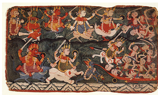
The Goddess Ambika Leading the Eight Matrikas in Battle Against the Demon Raktabija, Folio from a Devi Mahatmya - (top row, from the left) the Matrikas - Narasimhi, Vaishnavi, Kumari, Maheshvari, Brahmi. (bottom row, from left) Varahi, Aindri, Chamunda or Kali (drinking the demon's blood), Ambika. on the right, demons arising from Raktabija's blood

In Kālī's most famous legend, Devi Durga (Adi Parashakti) and her assistants, the Matrikas, wound the demon Raktabija, in various ways and with a variety of weapons in an attempt to destroy him. They soon find that they have worsened the situation for with every drop of blood that is dripped from Raktabija he reproduces a clone of himself. The battlefield becomes increasingly filled with his duplicates. [20] Durga, in need of help, summons Kālī to combat the demons. It is said, in some versions, that Goddess Durga actually assumes the form of Goddess Kālī at this time. The Devi Mahatmyam describes: