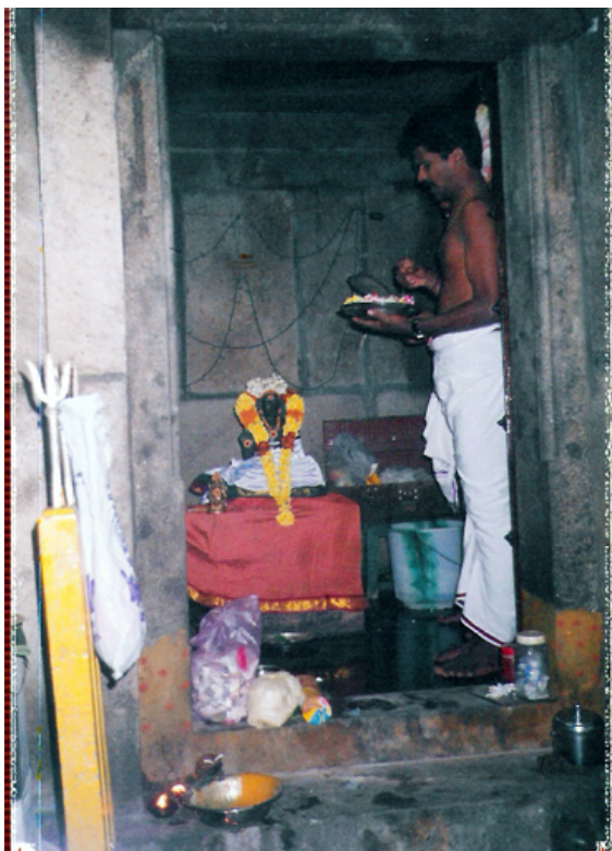
Puja is being conducted to the idol of Babaji Mahavatar

have led many to believe that Mahavatar Babaji is a legendary person, rather than a real sadhu that was seen by numerous witnesses from 1861 to 1935.