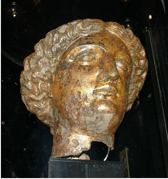
A head of "Sulis-Minerva" found in the ruins of the Roman baths in Bath

of Minerva on the Aventine Hill . Among others, its members included Livius Andronicus . The Aventine sanctuary of Minerva continued to be an important center of the arts for much of the middle Roman Republic.