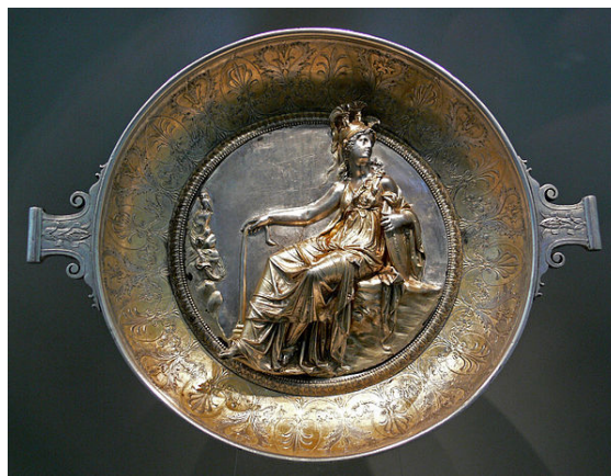
Raised-relief image of Minerva on a Roman gilt silver bowl, 1st century BC

As Minerva Medica , she was the goddess of medicine and doctors. As Minerva Achaea , she was worshipped at Luceria in Apulia where votive gifts and arms said to be those of Diomedes were preserved in her temple. [5][6]