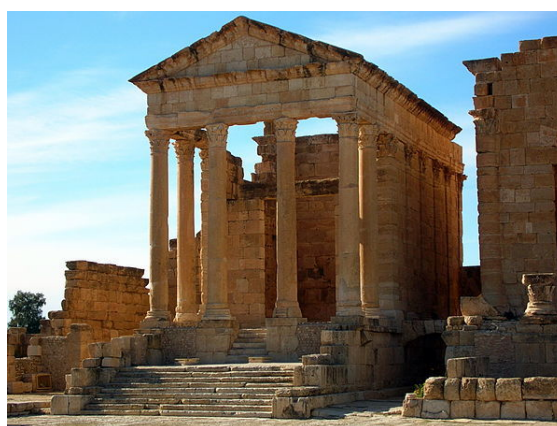
Temple of Minerva in Sbeitla, Tunisia

In Fasti III, Ovid called her the "goddess of a thousand works". Minerva was worshipped throughout Italy, and when she eventually became equated with the Greek goddess Athena , she also became a goddess of war, although in Rome her warlike nature was less emphasized. [7] Her worship was also taken out to the empire — in Britain, for example, she was conflated with the local wisdom goddess Sulis .