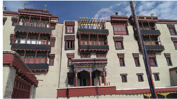
The Stok Royal Palace, residence of the Namgyal dynasty, former rulers of the former Ladakh kingdom, now part of the Indian state of Jammu & Kashmir.

most famous of which are Hemis and Hanle. [1]