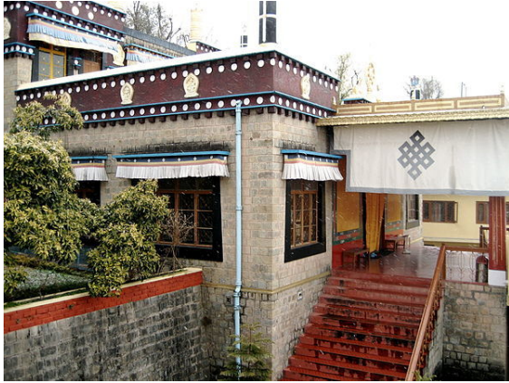
Namgyal Monastery Dharamsala, India

Namgyal (Tibetan: རྣམ་རྒྱལ།, Wylie: nam rgyal ) Monastery is a Tibetan buddhist monastery closely associated with all the Dalai Lamas since the third. Namgyal Monastery is the personal monastery of the 14th Dalai Lama.