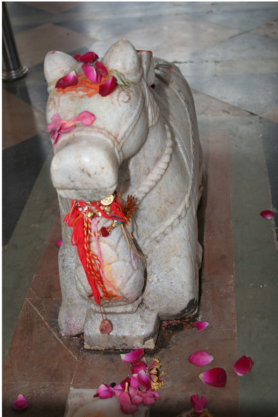
Nandi in white marble, Udaipur district, Rajasthan

Bulls appear on the Indus Valley seals, including the 'Pasupati Seal', which depicts a seated figure, and according to some scholars is similar to Shiva. However, most