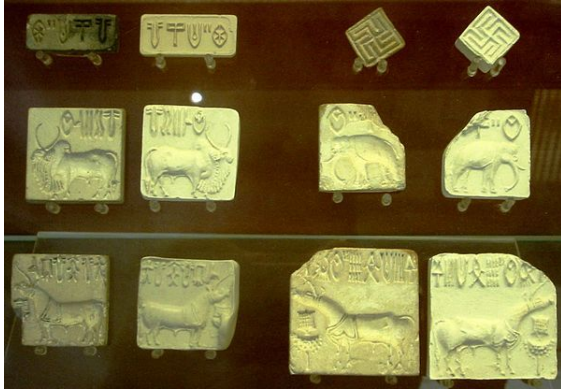
Bull seal from Indus Valley Civilization.