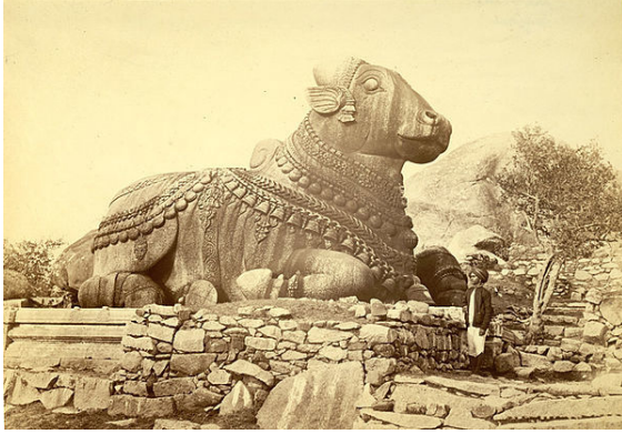
2nd Century A.D sculpture of Nandi bull.