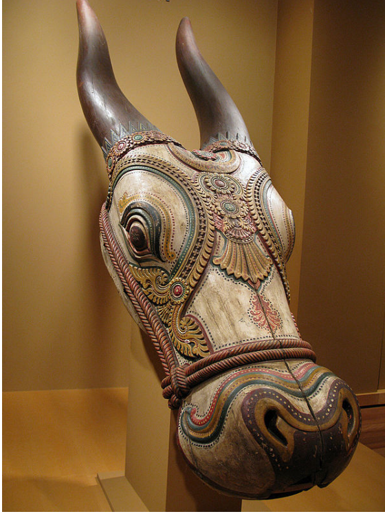
Ceremonial wooden Nandi, Kerala, late 18th century