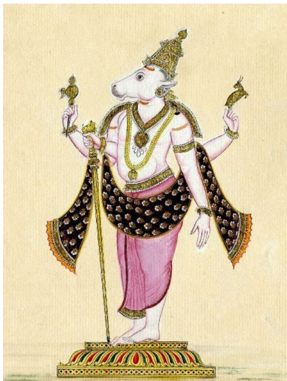
Nandi in a zoo-anthropomorphic form