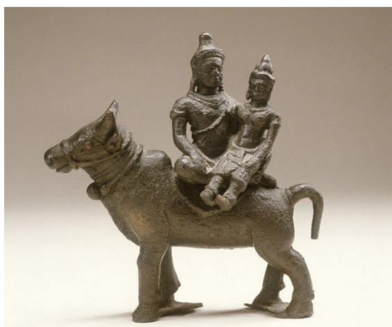
Shiva and his spouse seated upon Nandi. Cambodian, between 1100 and 1150. [8] The Walters Art Museum.

in search of Sita, who was kept prisoner by Ravana in Ashok Vatika. In one puranic story, it is stated that once Siva and Parvathi were playing a game of dice. For any game there has to be an umpire, who has to declare who is the winner. Siva and Parvathi agreed to have Nandi (the divine bull) as the umpire. Nandi is a favorite of Siva, as he is Siva's vehicle. Although Siva lost the game, Nandi declared him the winner. It is stated that Parvathi was indignant over Nandi's partiality for Siva and cursed him that he should die from an incurable disease. Thereupon Nandi fell at the feet of Parvathi and pleaded for forgiveness. "Mother forgive me. Should I not show at least this amount of gratitude to one who is my master? Is it