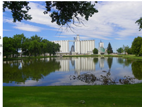
Lake and Grain Elevators

Omnism , to me, means that you don't have to limit yourself to one dogmatic formula to come closer to the Divine. You can be spiritual without having a religion. And you can have faith without structure. I firmly believe, when it boils right down to it, all the Gods are One in the End.