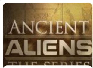
Ancient Astronauts; That Old Fall-Back