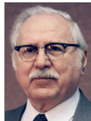
— Zecharia Sitchin

I have written about Sitchin's shortcomings in the past ( here and here ) and I'm not about to duplicate that work, other than to say that Sitchin, who taught himself to decipher ancient Sumerian cuneiform, is widely regarded as having mistranslated certain ancient Sumerian texts, which ultimately formed the basis of his theory. He is also widely criticised for his erroneous astronomical and scientific interpretations and literalism of myths. Having died in 2010 at the age of 90 with more than 14 books under his belt, Sitchin's legacy is bound to live on for many years, in spite of the fact that the scientific community views his theory as far more fiction than fact.