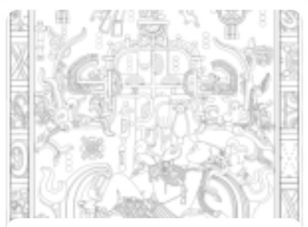
Pakal's Tomb: Erich von Däniken's Fantasy