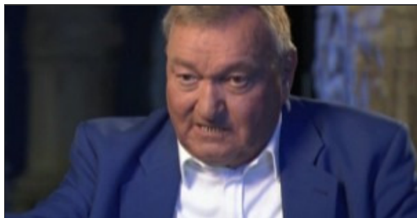
— Erich von Däniken

Both men have their own pet theories, Sitchin claims that the Anunnaki, a supposed race of aliens who call the fictitious planet Nibiru home, are charged with interfering with human development in the era of pre-history, to make a hybrid race of beings called the Nephilim, for, shall we say, commercial means.