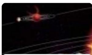
Nibiru Doesn't Exist and Planet X Is Not What You Think It