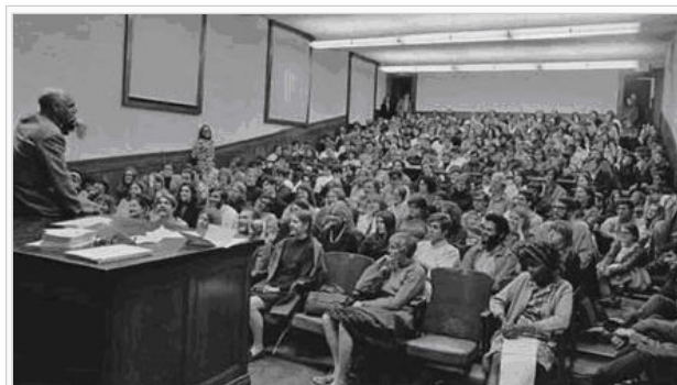
Eknath Easwaran teaching what is thought to be the first credit course on meditation offered at a major university in the U.S. at U.C. Berkeley in 1968

He set up a publishing activity, Nilgiri Press, which printed his first book Gandhi The Man , telling the story of Gandhi as a spiritual as well as a political leader. His first major work was his 3-volume commentary on the Bhagavad Gita, the Bhagavad Gita for Daily Living , the first volume of which was printed in 1975 and the last in 1984. His book Meditation on the program of meditation and allied disciplines that he developed first appeared in 1978.