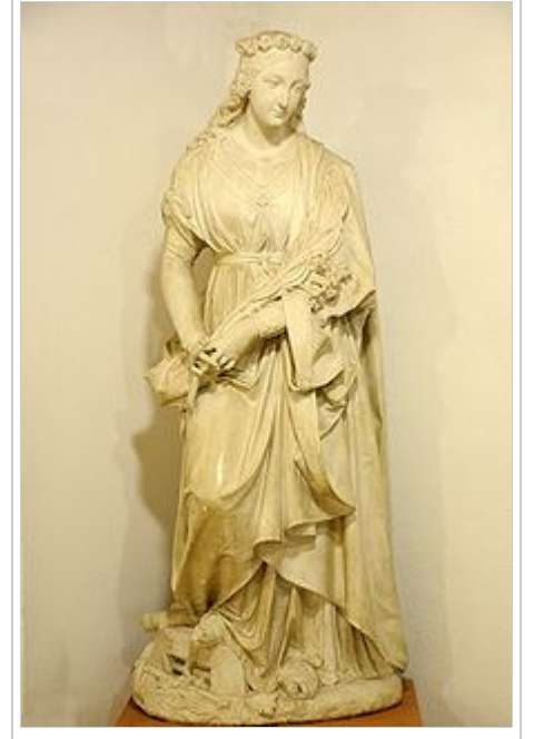
Saint Philomena with attributes: palm, whip, anchor and arrows. Plaster cast by Johann Dominik Mahlknecht in the Museum Gherdëina in Urtijëi, Italy

On 24 May 1802 in the Catacombs of Priscilla on the Via Salaria Nova an inscribed loculus (space hollowed out of the rock) was found, and on the following day it was carefully examined and opened. The loculus was closed with three terra cotta tiles, on which was the following inscription: lumena paxte cumfi . It was and is generally accepted that the tiles were in a wrong order and that the inscription originally read, with the leftmost tile placed on the right: pax tecum Filumena (i.e. "Peace with