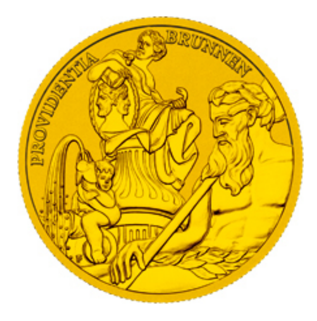
The figure of Providentia from a sculpture group in Vienna, as depicted on an Austrian 100-euro gold coin

Providentia has been the main motif for many collector coins and medals, the most recent one is the famous 100 euro Sculpture Gold coin issued on November 13, 2002. The reverse features the Providentia Fountain ("Provendentia Brunnen") in central Vienna, work of one of the greatest baroque sculptor Georg Rafael Donner. In the centre of the coin, the allegorical figure of Providentia with a medallion of the Roman god, Janus, who had two faces, is displayed. Surrounding the fountain there are other symbolic figures representing tributary rivers of the Danube. Providentia is enthroned high above the figure of an old man representing the Enns River.