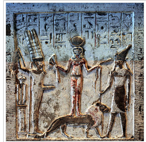
Qetesh wearing the headdress of Hathor and standing on a lion. She holds a lotus flower to Min and a snake to Resheph