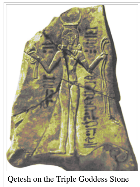
Qetesh on the Triple Goddess Stone