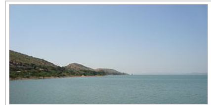
Renuka Sagara, Malaprabha River, Saundatti, North Karnataka, Karnataka

When she was eight, Agastya, who was the guru of the Renuka Raja, advised him to have his daughter married to Jamadagni when she reached maturity. Jamadagni was the son of Ruchik Muni and Satyavati and had obtained the blessings of the gods by performing severe penance. Renuka and Jamdagni Muni lived in the Ramshrung mountains, near the present day Savadatti area of Belgaum district. Renuka helped the Jamdagni Muni in all of his tasks of performing various rituals and puja. Gradually she became close and dear to Jamdagni. After a while Renuka Raj was blessed with another daughter called Anjana (Anjana Devi). Renuka would wake up early in the morning to bathe in the Malaprabha River with complete concentration and devotion. Her devotion was so powerful that she was able to create a pot to hold water made only of sand, one fresh pot every day. She would fill this pot, on the bank of the river and would use a snake which was nearby, turning it into a rope-like convolution and placing it on her head, so that it supported the pot. Thus, she brought the water to Jamdagni for his rituals of oblation. ("Renuka" is derived from the Sanskrit for "fine grain of sand".) Renuka temple is situated at near Zamania, Ghazipur.