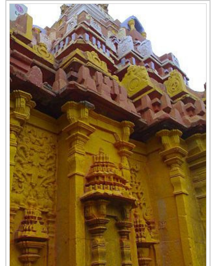
Renuka temple at Yallammagudi, Saundatti, North Karnataka, Karnataka

In many traditions, Renuka and Yellamma are taken to be two names for the same goddess. However there is also an oral tradition that distinguishes between the two. According to these tales, Renuka fled to a low-caste community when her son Parushurama was coming to kill her. He found and beheaded her, along with a low-caste woman who had tried to protect her. When he later brought them back to life, he mistakenly attached the woman's head to Renuka's body, and vice versa. Jamadagni accepted the former as his wife Renuka, while the latter remained to be worshipped by the lower castes as Yellamma, the mother of all. Matangi, Renuka, and Yellamma are all names of the Goddess. [1]