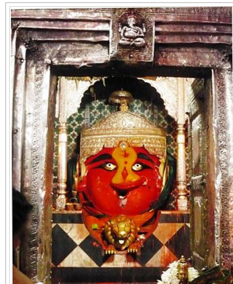
The icon of Renuka at the sanctum of the Mahur temple, a Shakti Peetha.

Yellamma is worshipped mostly in South India, including Telangana, Karnataka, Tamil Nadu, Andhra Pradesh and Maharastra, where the deity is known by many names: Mahankali , Jogamma , Somalamma , Gundamma , Pochamma , Mysamma , Jagadambika , Holiyamma , Renukamata , Yellamma , Mariamamma and Renuka Devi , Ellai Ammam .