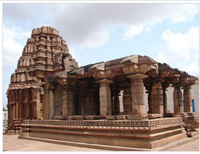
Yellamma temple at Badami.

Jamadagni was still furiously angry with Renuka and ordered his sons to punish their mother. One by one, four of them refused flatly. Jamadagni, who possessed the power to burn anyone to ashes with his one look, was so angry that he went berserk and turned four of his sons into four piles of ashes. Parashurama, who was not there when this happened, found his mother weeping by the piles of ashes when he arrived and his father was still raging mad. Jamadagni told him what happened and ordered him to behead his mother for her infidelity. Parashurama had to think quickly. Knowing his father's powers and the extent of his anger, Parashurama immediately obeyed his father, using his axe.