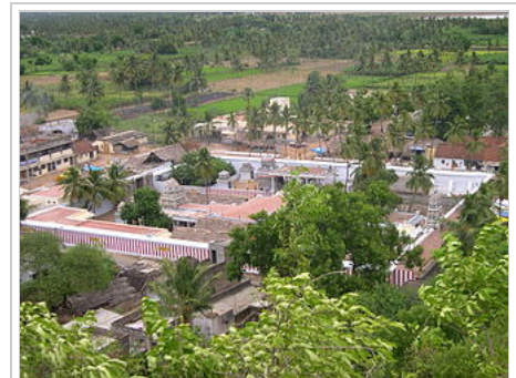
Renugambal Amman Temple Padavedu, Thiruvannamalai District