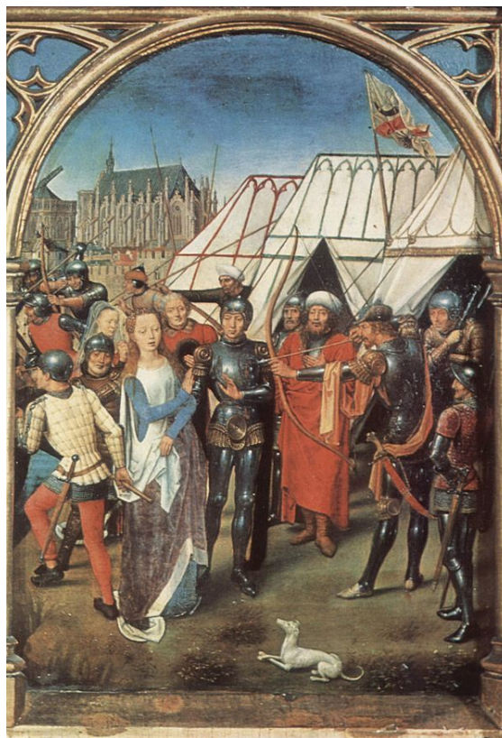
Hans Memling, The Martyrdom of Saint Ursula.

Her legend, probably not historical, [2][3] is that she was a princess who, at the request of her father King Dionotus of Dumnonia in south-west Britain, set sail to join her future husband, the pagan governor Conan Meriadoc of Armorica, along with 11,000 virginal handmaidens. After a miraculous storm brought them over the sea in a single day to a Gaulish port, Ursula declared that before her marriage she would undertake a pan-European pilgrimage. She headed for Rome with her followers and persuaded the Pope, Cyriacus (unknown in the pontifical records, though from late 384 there was a Pope Siricius), and Sulpicius, bishop of Ravenna, to join them. After setting out for Cologne, which was being besieged by Huns, all the virgins were beheaded in a massacre. The Huns' leader shot Ursula dead, in about 383 (the date varies).