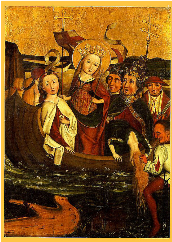
The Martyrdom of Saint Ursula (German art, 16th century)

was misread as cum [...] millibus “with [...] thousands”. [5]