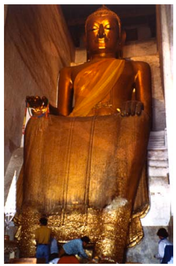
Applying gold leaf to the unusual seated Buddha image in Wat Palelai Suphanburi, Thailand