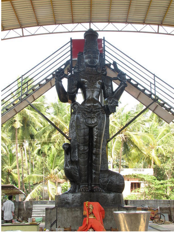
23 feet tall statue of Shani in Bannanje, Udupi

Shani (Sanskrit: शनि, Śani) is one of the Navagraha