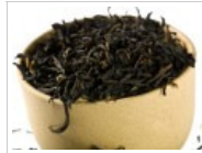
What happens to your body when you take a free testosterone supplement?