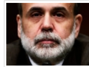
Stocks soar--but some wealthy citizens are preparing for "The End of America." Here's why.