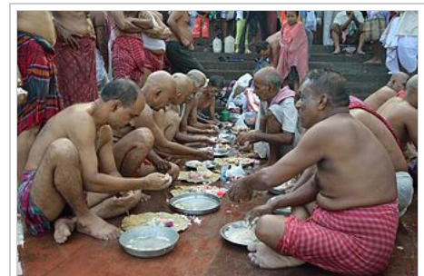
A mass Pinda Pradaana is being done at the Jagannath Ghat, Kolkata, at end of the Pitru Paksha.