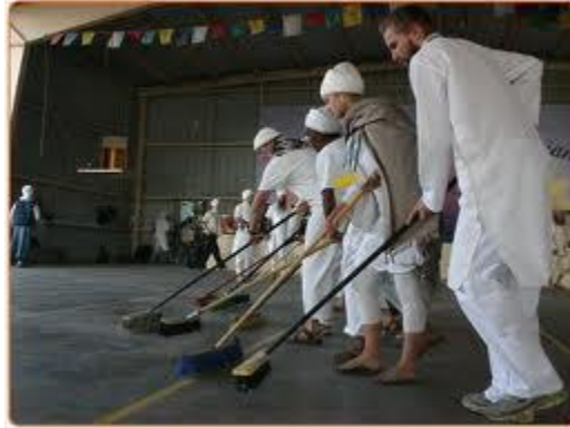
Karma Yoga is a path to God