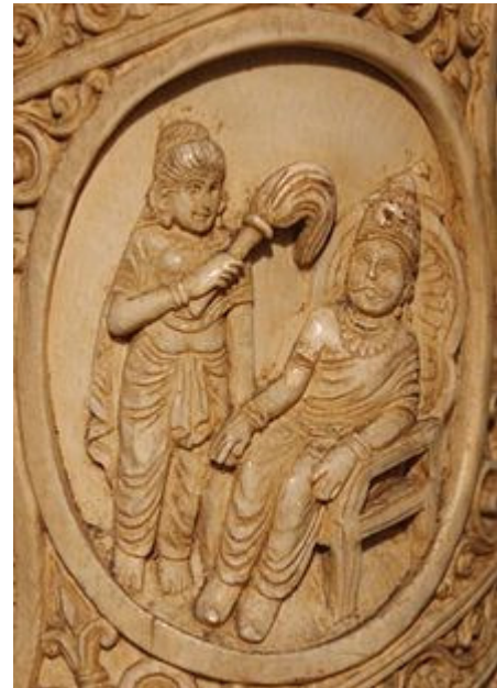
Śuddhodana and his court