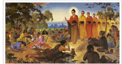
Sumedha, the youth who would in the distant future become Gautama Buddha, receiving his niyatha vivarana (prediction of future Buddhahood) from the Dīpankara Buddha