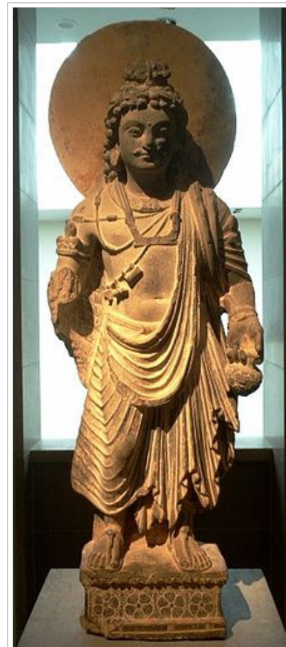
Maitreya Buddha from the 2nd century Gandharan Art Period