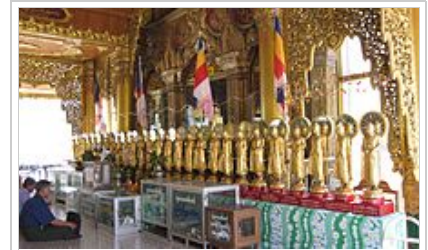
Buddhist men at the Sule Pagoda in Yangon, Myanmar, paying homage to the 28 Buddhas described in Chapter 27 of the Buddhavamsa

Many Buddhists also pay homage to the future (and 29th) Buddha, Maitreya. According to Buddhist scripture, Maitreya will be a successor of Gautama who will appear on Earth, achieve complete enlightenment, and teach the pure Dharma . The prophecy of the arrival of Maitreya is found in the canonical literature of all Buddhist sects (Theravāda, Mahāyāna, and Vajrayāna), and is accepted by most Buddhists as a statement about an event that will take place when the Dharma will have been forgotten on Jambudvīpa (the terrestrial realm, where ordinary human beings live).