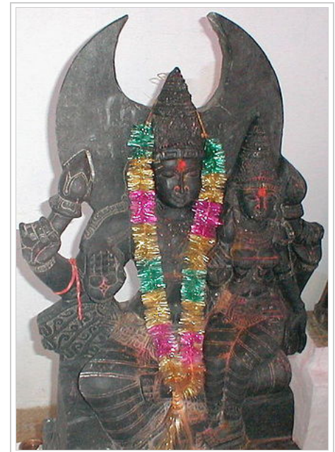
Chandra with Rohini

Chandra is known for having a series of disastrous love affairs. His first lover, Tara, was the wife of Brihaspati, the planet Jupiter. From their union, Tara became pregnant gives birth to Budha (a.k.a. the planet Mercury, not to be confused with the other Buddha). Because of how he was conceived, Budha hated his father and as Chandra also knew that Budha is his illegitimate son, he began to hate his son, and their rivalry continues to this day. For the sin of abducting another god's consort, Brahma banished Chandra to the outer atmosphere. This story illustrates allegorically the prohibition of intoxicants for Brahmins. [5] After that, Chandra, set out to marry the twenty-seven daughters of Daksha. Daksha allowed this on the condition that the moon not favor any daughter over the others. Chandra failed to do this, and Daksha placed a curse on him that took away his luster, which accounts for the moon's waxing and waning.