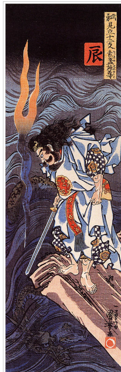
Susano'o slaying the Yamata no Orochi , by Utagawa Kuniyoshi

Though she was persuaded to leave the cave (with the help of a ceremony and a unique style of dancing), Susanoo was punished by being banished from Heaven. He descended to the province of Izumo, where he met