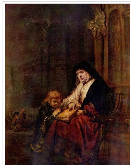
Rembrandt's Timothy and his grandmother , 1648.

In the 4th century the relics of Timothy were transferred to Constantinople and placed in the church of the Holy