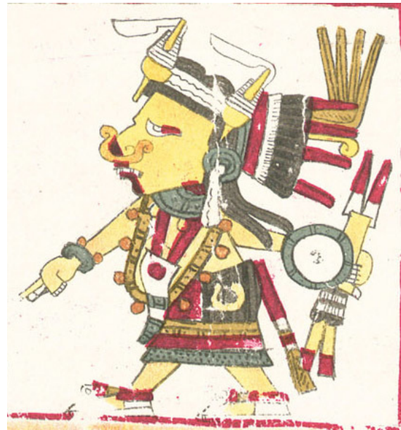
A depiction of Tlazoteotl, styled as in the Codex Borgia manuscript.

In Aztec mythology, Tlazolteotl (or Tlaçolteotl , Nahuatl pronunciation: /tʎasoʎˈteotʎ/) is a goddess of purification, steam bath, midwives, filth, and a patroness of adulterers. In Nahuatl, the word tlazolli can refer to vice and diseases. Thus, Tlazolteotl was a goddess of filth (sin), vice, and sexual misdeeds. However, she was a purification goddess as well, who forgave the sins and disease of those caused by misdeeds, particularly sexual misdeeds. [1] Her dual nature is seen in her epithets; Tlaelquani ('she who eats filth [sin]') and Tlazolmiquiztli ('the death caused by lust'), and Ixcuina or Ixcuinan ('she of two faces'). [2][3] Under the designation of Ixcuinan she was thought to be plural in number and four sisters of different ages by the names; Tiacapan (the first born), Teicu (the younger sister), Tlaco (the middle sister) and Xocotzin (the youngest sister). [3]