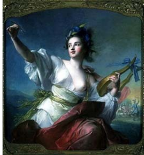
Terpsichore, Muse of Music and ballet, an oil on canvas painting by Jean-Marc Nattier (1739).

after a Muse. Terpsichore was the name of the fifth book.