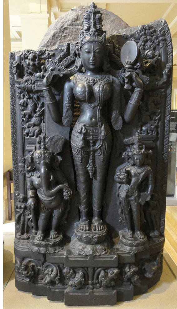
Lalita with sons Ganesha and Skanda, Odisha. 11th century sculpture from the British Museum

The Soundarya Lahari of Adi Shankaracharya deals exhaustively about the nature of the Goddess and her worship.