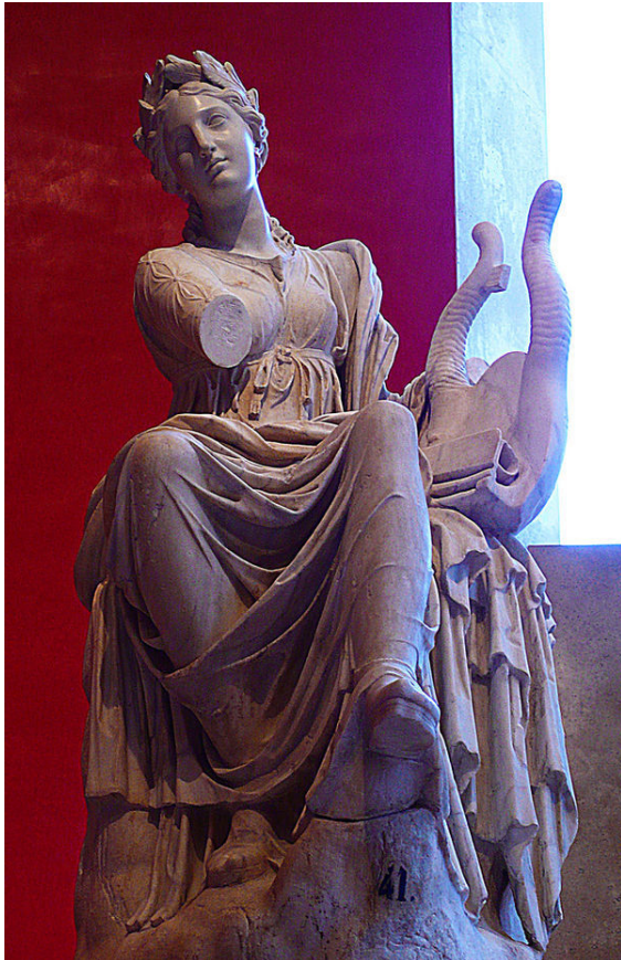
Roman statue of Terpsichore from Hadrian's Villa, presently at the Prado Museum (Madrid).

In Greek mythology, Terpsichore ( / t ər p ˈ s ɪ k ə r iː / ;