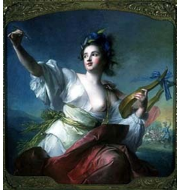
Terpsichore, Muse of Music and ballet, an oil on canvas painting by Jean-Marc Nattier (1739).

after a Muse. Terpsichore was the name of the fifth book.