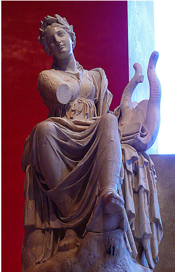
Roman statue of Terpsichore from Hadrian's Villa, presently at the Prado Museum (Madrid).

In Greek mythology, Terpsichore ( / t ər p ˈ s ɪ k ə r iː / ;