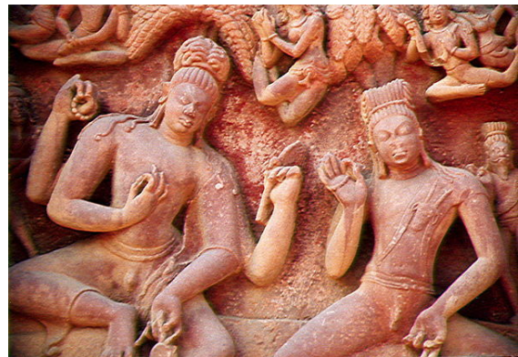
Narayana on the left and Nara on the right, Deogarh, Uttar Pradesh, ca. 5th century

There are many legends about the birth of Urvashi but the following one is most prevalent.