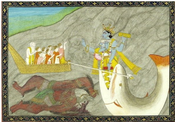
Matsya avatar of Vishnu pulls Manu's boat after having defeated a demon.

In Hindu mythology, Sraddhadeva Manu is the current Manu and the progenitor of the current humanity (manvantara). He is the seventh of the 14 Manus of the current kalpa (aeon).