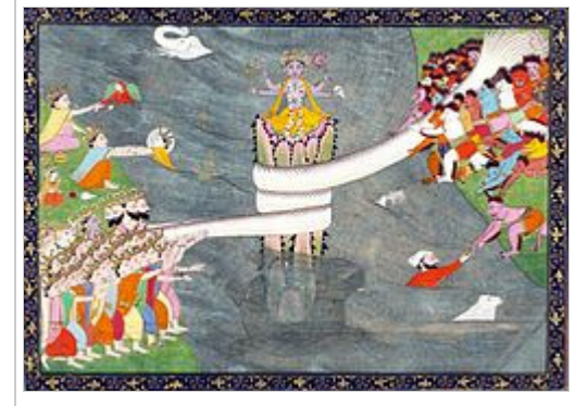
Kurma Avatar of Vishnu, below Mount Mandara, with Vasuki wrapped around it, during Samudra manthan, the churning of the ocean of milk. ca 1870.

In Buddhist mythology, Vasuki and the other Naga Kings appear in the audience for many of the Buddha's sermons. The duties of the naga kings included leading the nagas in protecting and worshiping the Buddha, as well as in protecting other enlightened beings.