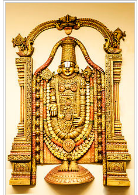
Lord Sri Venkateswara sculpture made in brass

[2] Every year, thousands of devotees donate a large amount of wealth at the Tirumala Venkateswara Temple at Tirupati, Andhra Pradesh. There is an interesting story to this. Goddess Lakshmi, also referred as Shri, once had