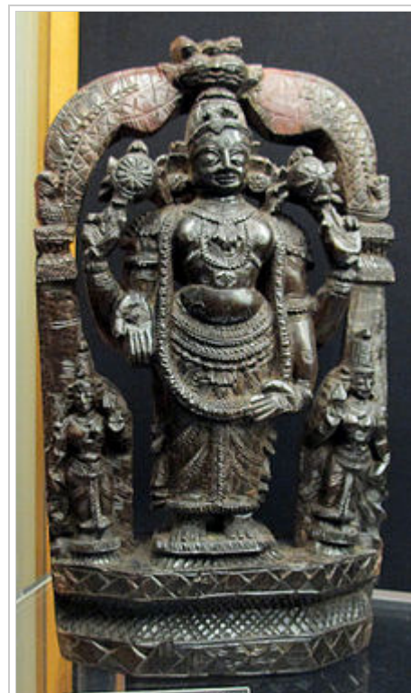
The stone statue of Venkateswara.

Thereafter, Lord Vishnu, also known by the name of Srinivasa, decided to stay in Varaha Kshetra and requested Sri Varaha swami to grant Him a site for His stay. His request being readily granted, Srinivasa ordained that a pilgrimage to His shrine would not be complete unless it is preceded by a bath in the Pushkarini and darshan of Sri Varaha swami and that pooja and naivedya should be offered to Sri Varaha swami first. Vishnu built a hermitage and lived there, attended to by Vakula Devi who looked after Him like a mother.