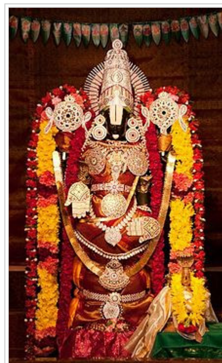
Lord Sri Venkateswara at Parashakthi Temple in Pontiac, Michigan, USA